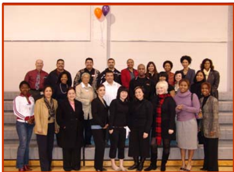
(EOYDC 1st Annual College Fair 2006) Vocation/Education Partners