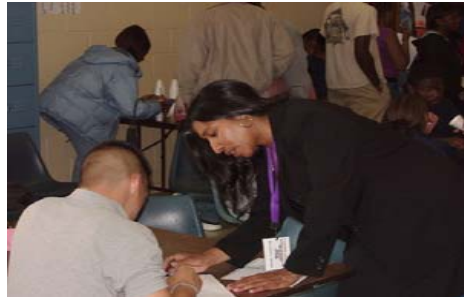
(Job Fair Instruction)

Youth and young adults ages 16-26 years old (ages 14 and 15 during summer break) who desire part-time, full-time, summer and seasonal employment opportunities.