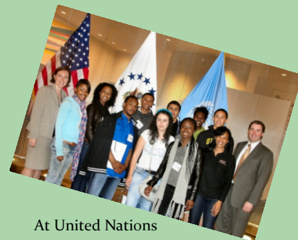
At United Nations

During the trip the students took a phenomenal tour of the United Nations and participated in a US Mission Briefing. They also traveled to Harlem to visit the Malcolm and Betty Shabazz Education Center and the famous Apollo Theater on 125th street and Lenox.