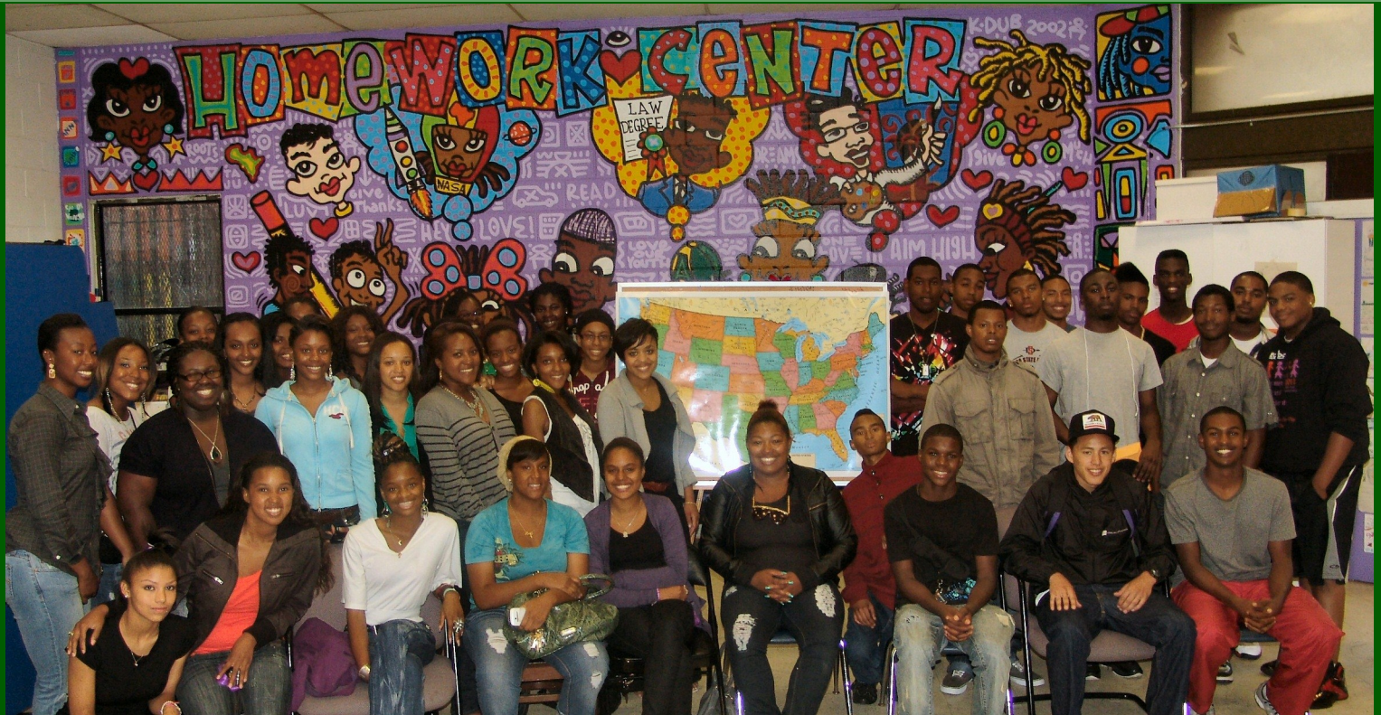
Brotherhood & Sisterhood Across America- August, 2011