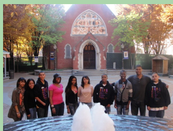
At Georgetown University

One aspect of this college tour was to allow youth to experience great institutions of higher education that they might not have considered researching.