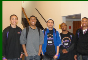
School of Visual Arts

"It feels so good to have Oakland in the house"